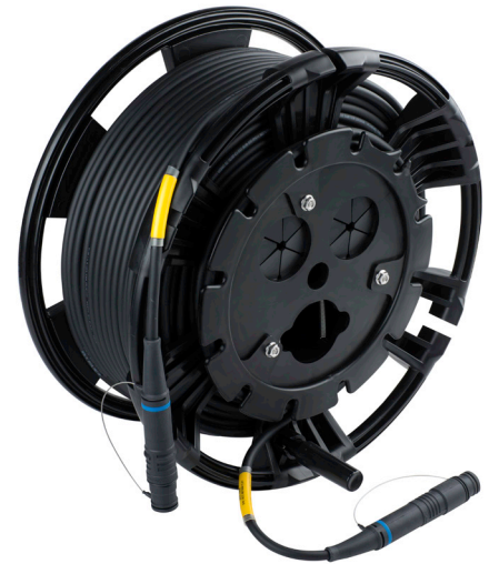
SMPTE Assembly on Mars Reel